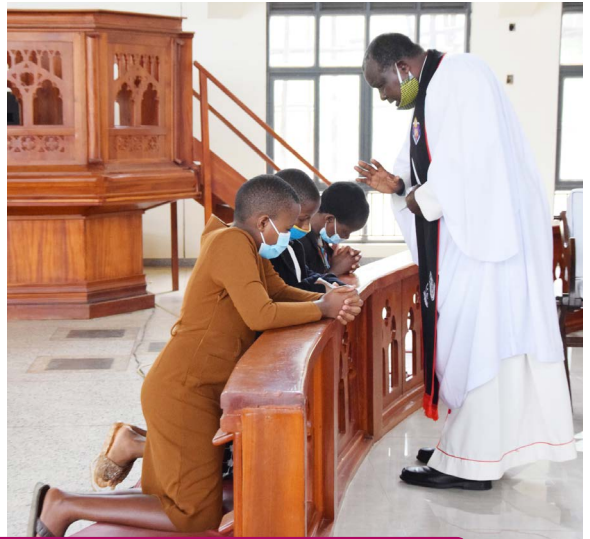
Left; preaching in the United States, right; praying for youth in All Saints