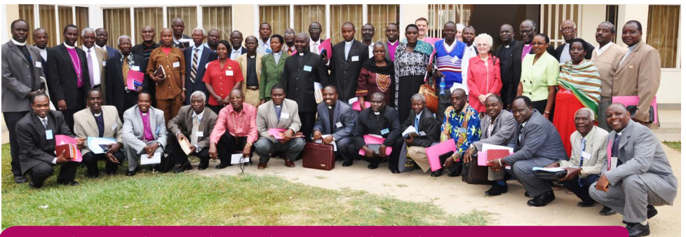
The Uganda Revival Team that convened in Ruharo in January 2013