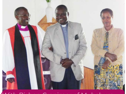
With Bishop Cranimer of Muhabura