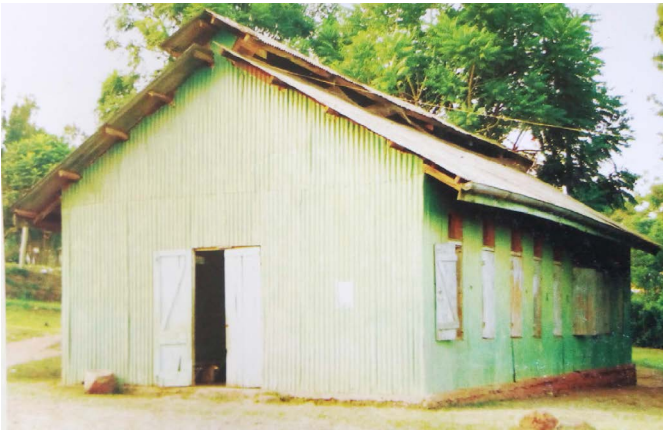
The first All Saints Church Sanctuary then called 'Ekijanjabu'