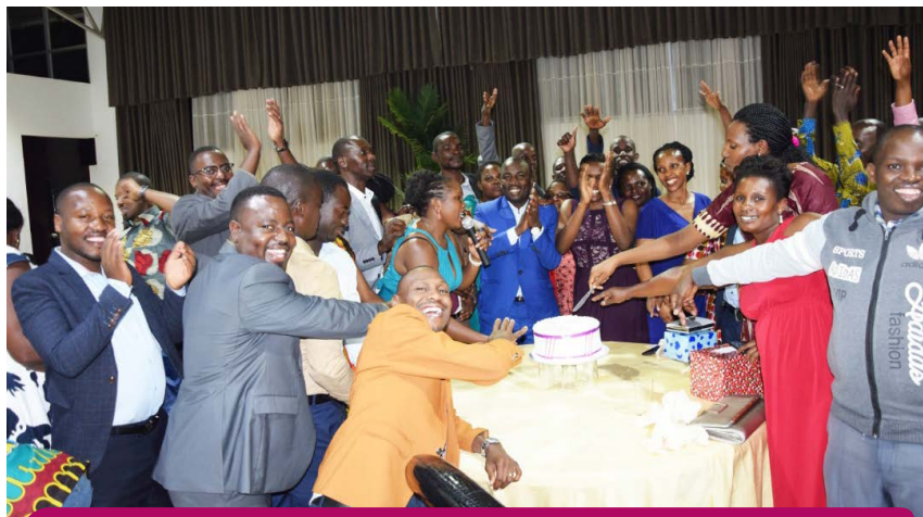
Members of the Young Marrieds Fellowship of All Saints at their 2018 Dinner

They cooked their own meals, prepared their own shelters, did community work and were exposed to what many would call a hard life. Yet these camping sessions are what God uses to refine us and build character in us. Most of these would be vaccists and campusers or even graduates. This camping raised and strengthened the Youth Ministry at All Saints Mbarara. This youth ministry itself did a great work in doing the Diocesan Youth Convention. Their impact has been great and we thank God.