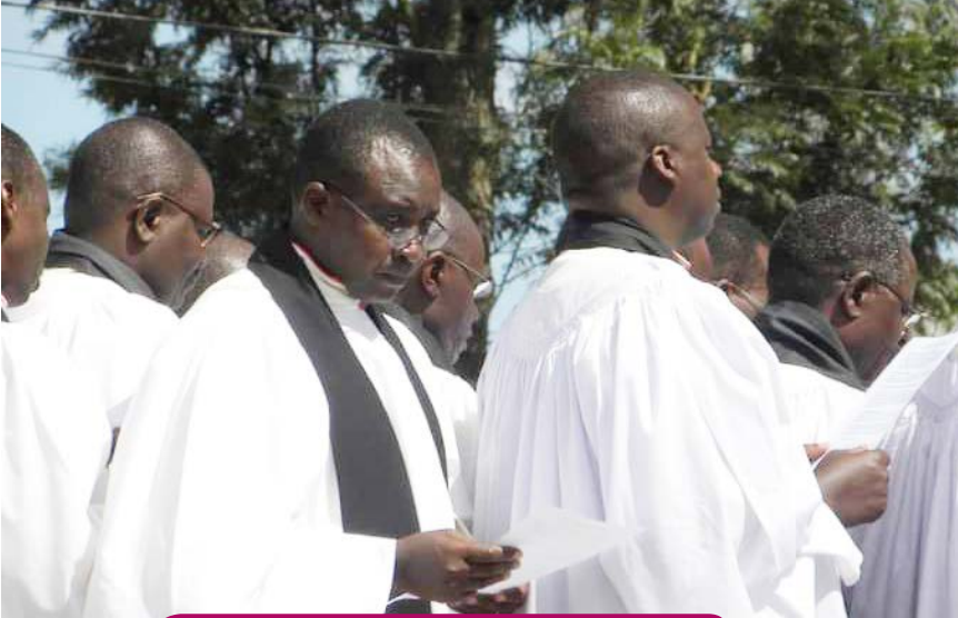
At the ceremony of becoming a Canon