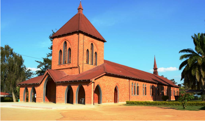
St. James Cathedral Ruharo that gave birth to All Saints in 1962. It is also where I got ordained in 2005