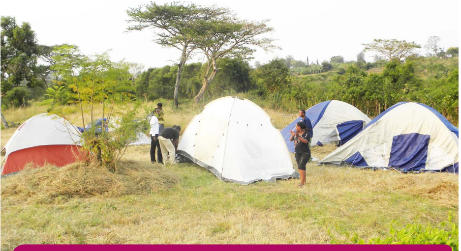
Youth from All Saints Mbarara camping at the PIM Center in Ruharo

I am so glad that the families in All Saints Mbarara trusted us with their children, to raise them and show them the way of the Lord. It's an honour for which we are grateful to God. They contributed very willingly to the missions activities and they know the value that these activities bring to them as we pray, counsel them and minister to them.