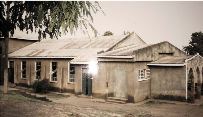
The second All Saints Church Sanctuary that was erased to put up the current auditorium