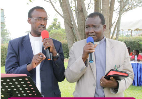
Translating during a Revival Convention